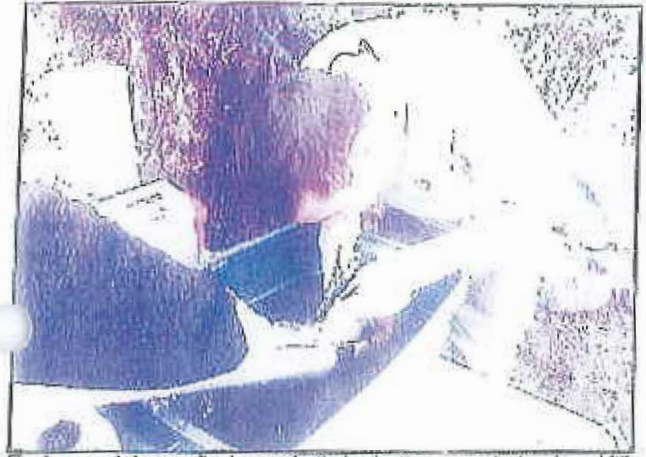
Environmentel consultants surgically implanting a sould lag in a Little Jackfish walleys.

While the EA for the proposed Project formally commenced in the spring of 2009, some preliminary field work was completed in 2008. Throughout 2009 OPG has carried out comprehensive field studies. Extensive work has been undertaken on fisheries and the aquatic ecosystem. This has included: a large telemetry program to better understand current fish movement; fish habitat assessments; and sampling programs for fish, water, sediment and soil.