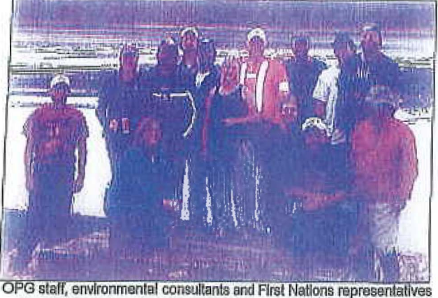
collaborating during field investigations on the fiver, August, 2009.

process by setting out such items as guiding principles, methods of participation, roles and responsibilities and a schedule of activities. Consultation for the WMP and EA processes will be coord/nated as much as possible.